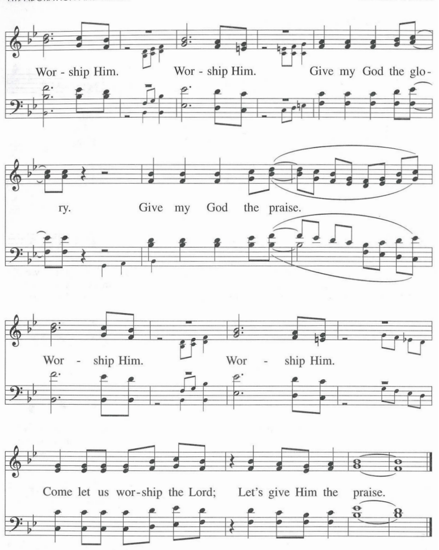
Text: Nettie L. Sawyer Lester, © 1992, Joy Publishing Co. (SESAC) Tune: Nettie L. Sawyer Lester, © 1992, Joy Publishing Co. (SESAC); arr. by Stephen Key, © 2000, GIA Publications, Inc.